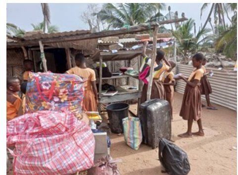
Children couldn't go to school.