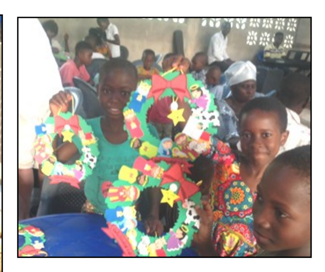
God is love. 1John 4:16