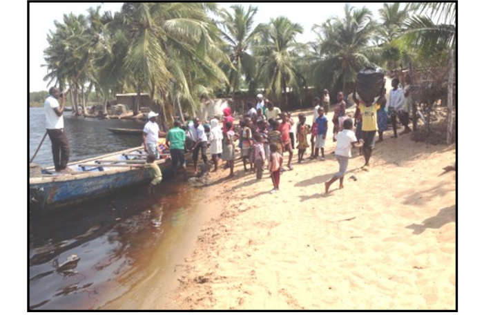
Past Hearts For Ghana Mission Christmas Celebrations!