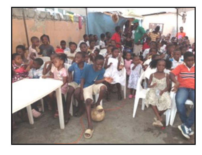
I looked for a man among them who would build up the wall and stand before me in the gap on behalf of the land. Ezekiel 22:30a